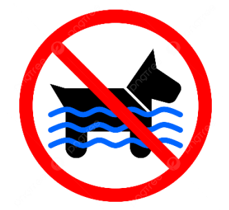
Pool Area/Cabana Usage and Reporting Protocol

Please remember that dogs should always be leashed and accompanied by their owners when walking within the community. Additionally, we encourage you to clean up after your pets promptly. Responsible pet ownership is essential to fostering a considerate and caring community for all.